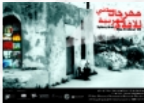
LAUNCH OF THE 2005 SYDNEY ARAB FILM FESTIVAL

In 2005, the second Sydney Arab Film Festival enabled 48 local and internationally-produced films to be screened across Campbelltown, Parramatta and Bankstown. Highlights included Egyptian classics from 1947 to 1971, the Australian premiere of Youssef Chahine's Alexandria New York , the epic The Door to the Sun spanning 50 years in Palestine, and student films from ALBA Fine Arts Academy, Lebanon. The Festival continues to be incubated and overseen by ICE.